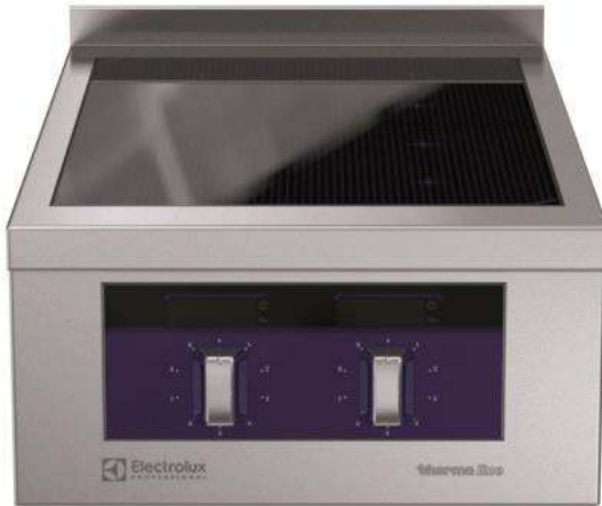
589016 (MCCBABEOAO) Infrared Top, 2 zones, one-side operated with backsplash